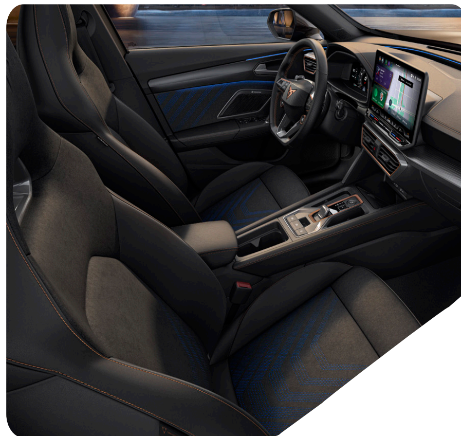
DYNAMIC AMBIENT - CG F VZ