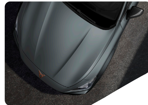
ENCELADUS GREY- Q7Q7 (Matt) vz