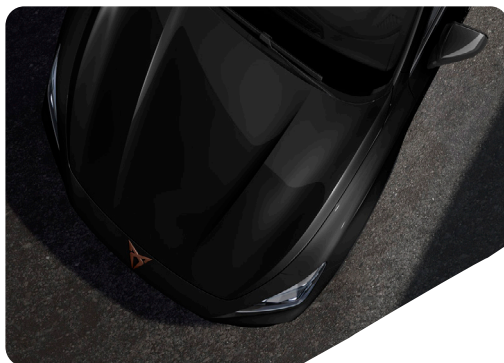
MIDNIGHT BLACK- OE0E (Metallic) F vz