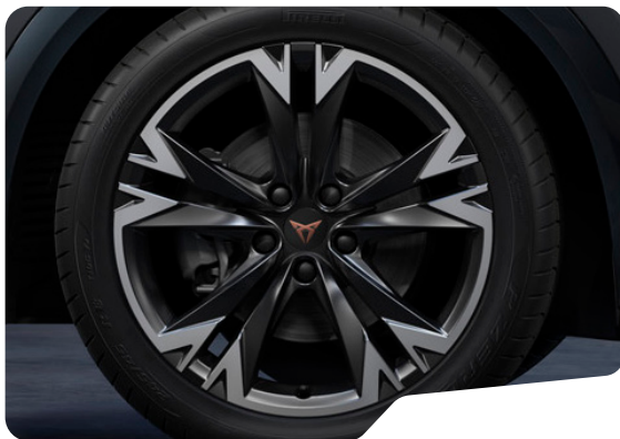
SONORA 18IN MACHINED SPORT BLACK / SILVER F