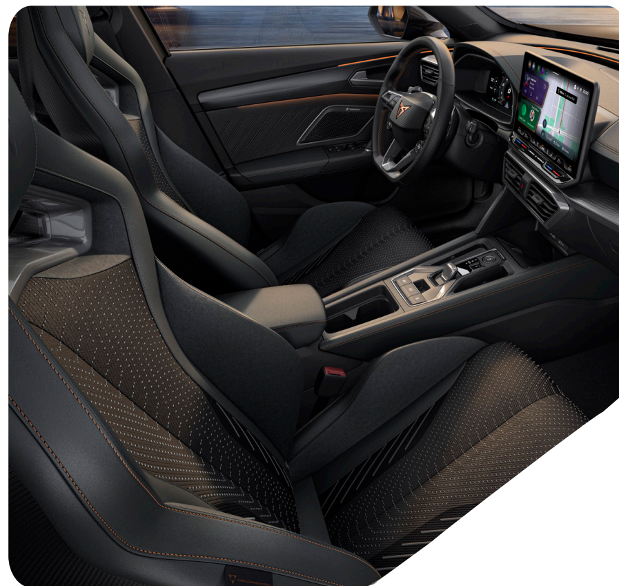
EXTREME AMBIENT - LN VZ