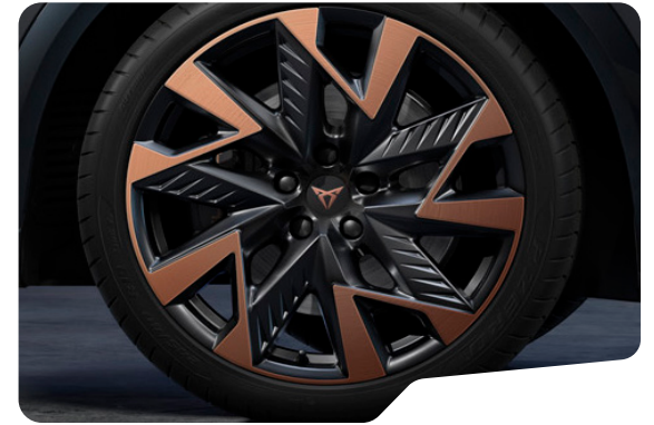
SANDSTORM COPPER 19IN MACHINED SPORT BLACK / COPPER F VZ