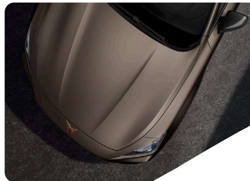
CENTURY BRONZE- L3L3 (Matt) vz