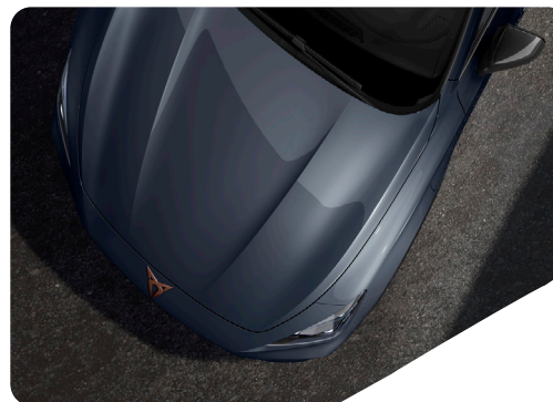
MAGNETIC TECH - S7S7 (Metallic) F vz