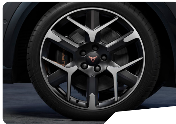
HAILSTORM 19IN FORGED MACHINED SPORT BLACK / SILVER VZ