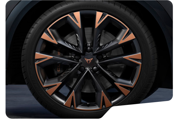
ARTIC COPPER 19IN MACHINED SPORT BLACK / COPPER F VZ