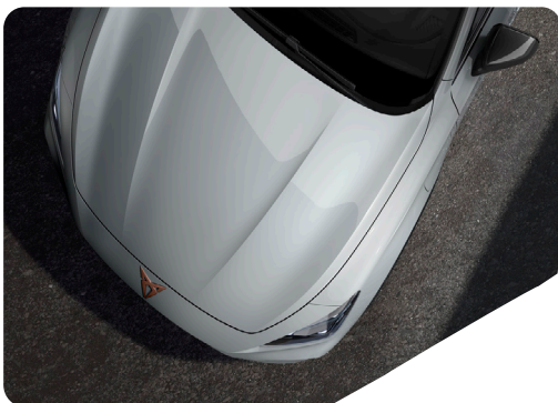
GLACIAL WHITE- 2Y2Y (Metallic) F vz