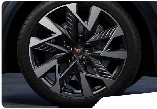
SANDSTORM 19IN MACHINED SPORT BLACK / SILVER F VZ