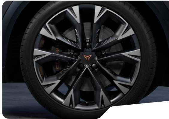
ARTIC 19IN MACHINED SPORT BLACK / SILVER F VZ