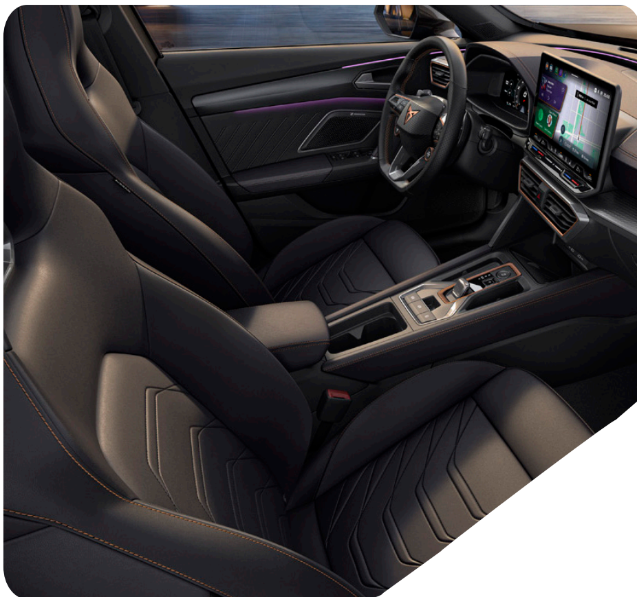
PROGRESSIVE AMBIENT - KE F VZ