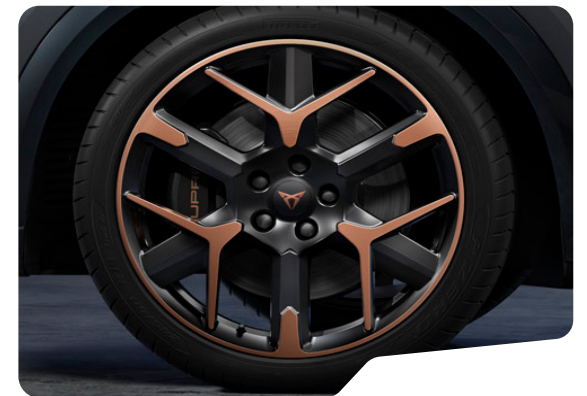
HAILSTORM COPPER 19IN FORGED MACHINED SPORT BLACK / COPPER VZ