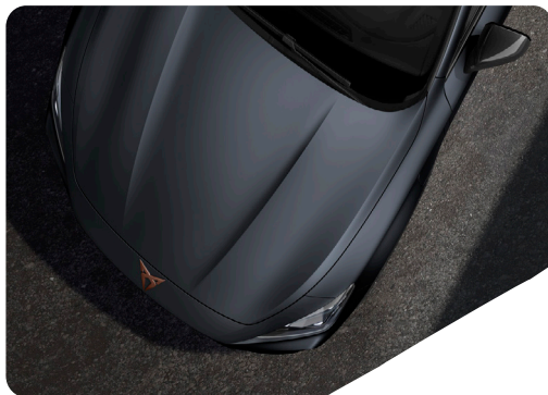
MAGNETIC TECH MATT - 9R9R (Matt) F vz