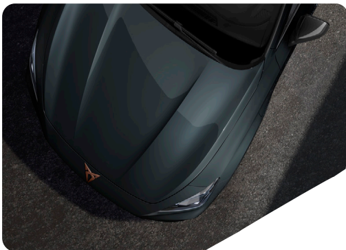
FIORD BLUE - 9K9K (Soft) F vz